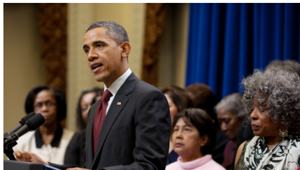
President Barack Obama announces the proposed rule at a White House ceremony, December 15, 2011.

"When this exemption to the FLSA was established in 1974, it was meant to apply to casual work arrangements like babysitting," then U.S. Secretary of Labor Hilda Solis said in 2011, announcing the proposed rule. "It was not intended to cover professionals whose vocation was in-home care service ... Professional caregivers are committed to their jobs. This is truly work from the heart, but it's also hard and demanding. So it's time for us to take better care of our nation's caregivers and provide them with the wage protections that they deserve."